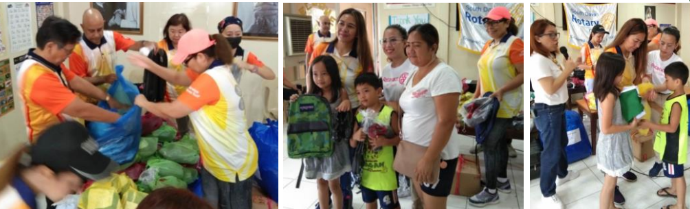
Handover of donations to the fire victims in Piapi at the Archdiocesan Nourishment Center (ANC). March 4 2023